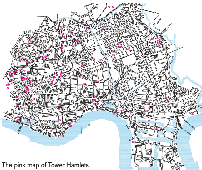
The pink map of Tower Hamlets

Mohammed Choudhury | 020 7364 4979 | mohammed.choudhury@towerhamlets.gov.uk